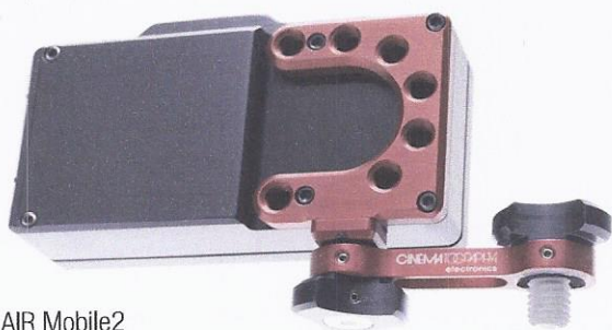
Rear of AIR Mobile2