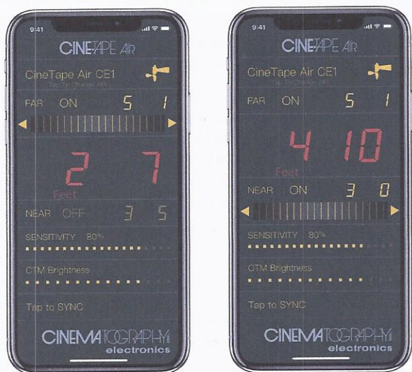
CineTape AIR App. iPhone at right shows NEAR limit ON.