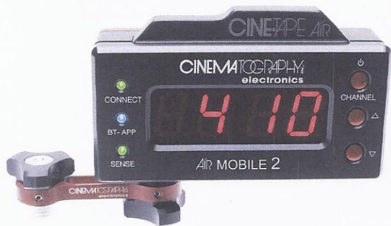
AIR Mobile2 Wireless Remote